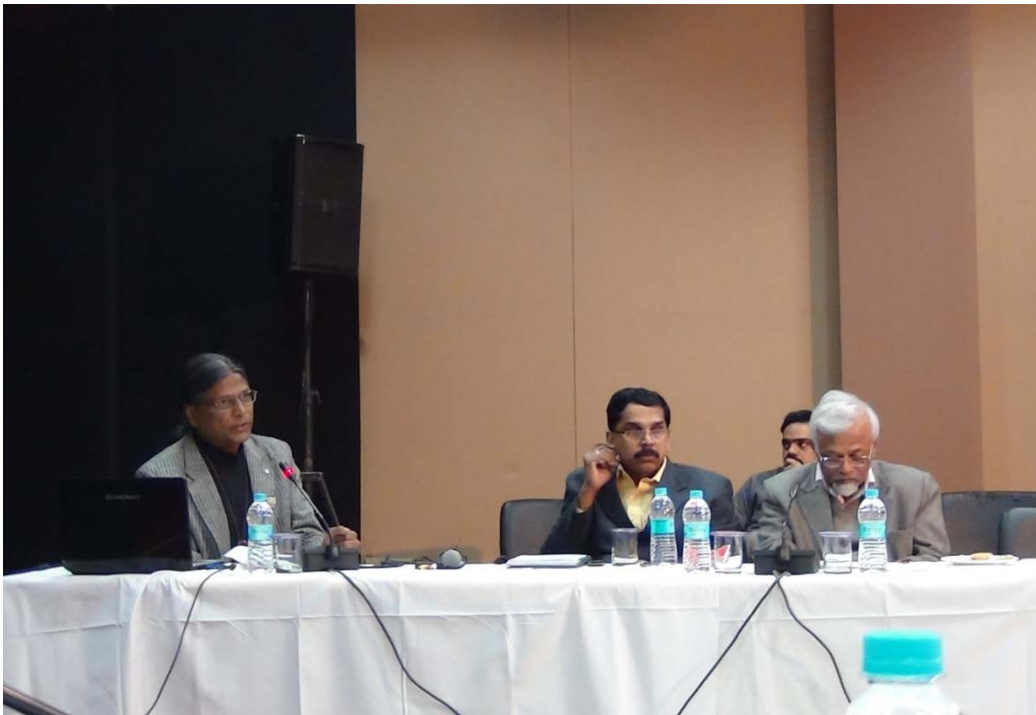
▲ Safeguarding India's ICH Seminar