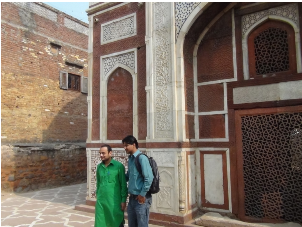
▲ Documenting the life in Nizamuddin Basti, Delhi