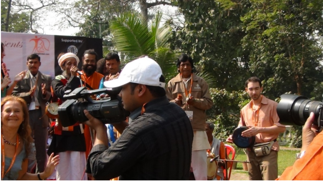
▲ Sahapedia team documents Sufi Music festival in Kolkata