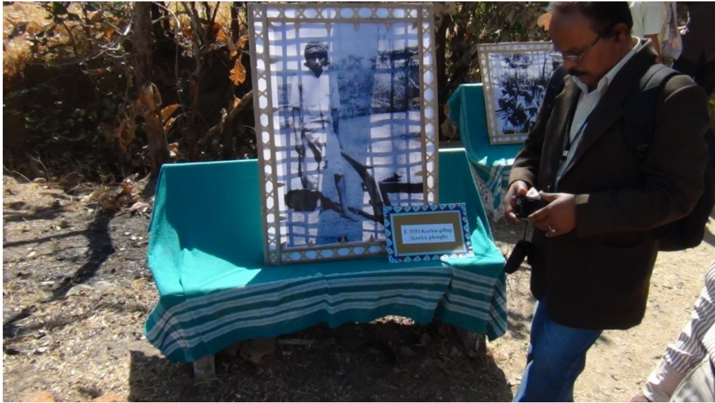
▲ Colonial Photographs of Indian tribals, an exhibition in Vadodra